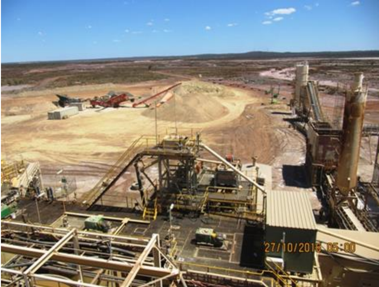
Figure 3 : Lakewood Mill ROM pad

Penny's Find contains a probable ore reserve of 146,000 tonnes @ 4.62g/t Au as announced to the ASX on the 15 February 2016.