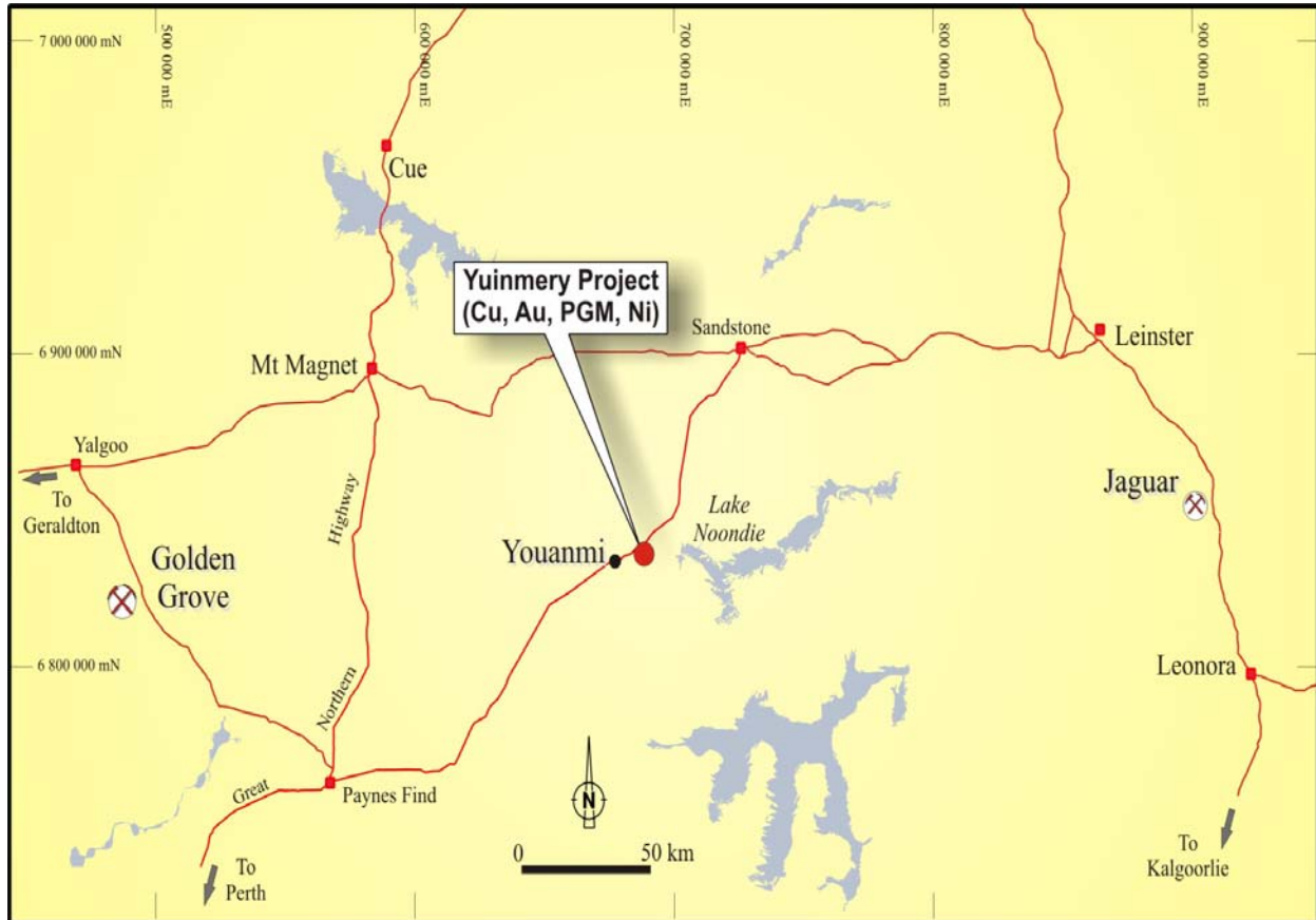
Figure 1: Yuinmery Project location map